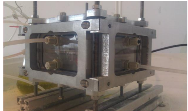
Figure 2: The lab-stack after assembling it for the first time.

picture is the first stack that was used in the REDstack experiments that helped define the final design.